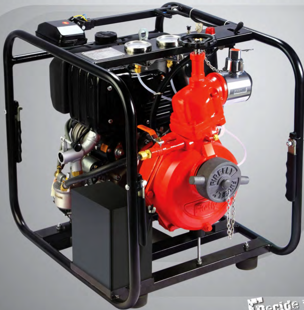
MFP 275-D Portable Fire Pump